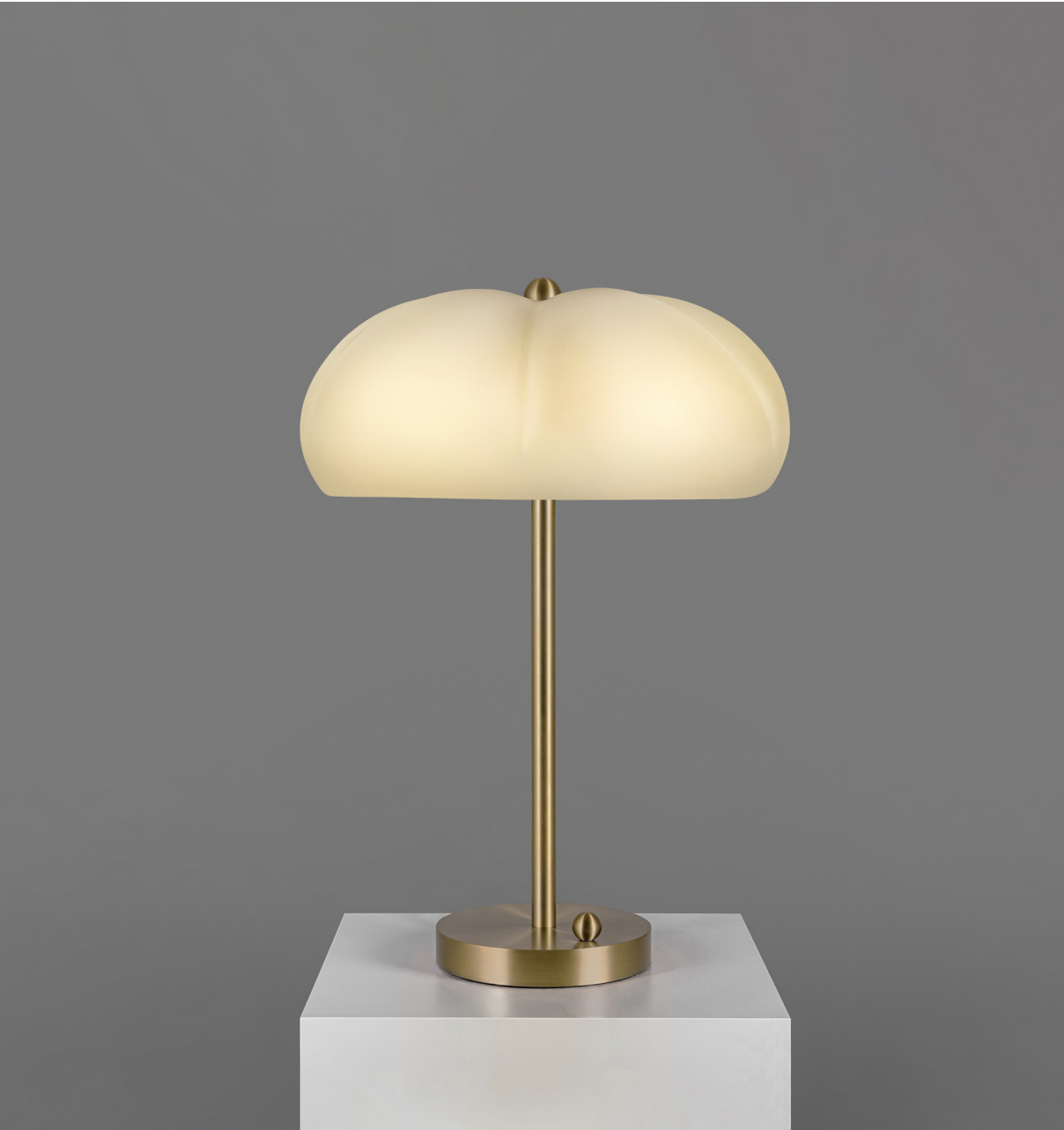
Hana Table Lamp - B672